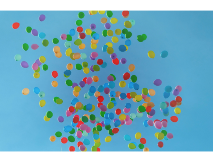
JEWISH JOY Eleanor Bolker

Note: Participants who are shomer shabbat can arrange materials without the use of glue/scissors Room: Myrtle